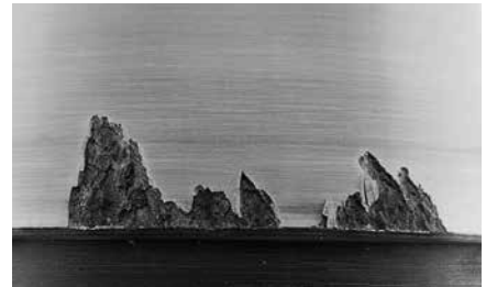
Fig. 2: Geometric Stress Concentration (GSC) spalling